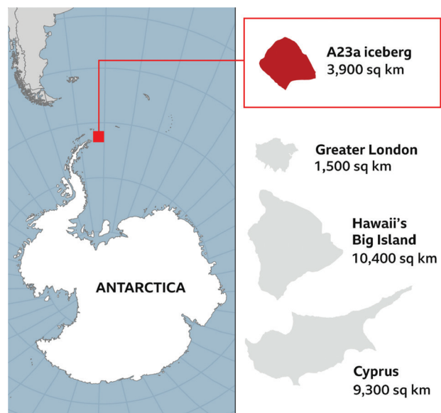
Iceberg vs land areas for comparison.