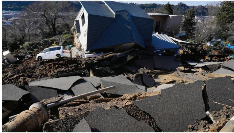
Earthquake in Japan - Dec-Jan 2024.