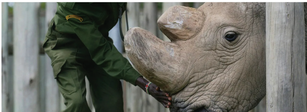
Sudan, the world's last male northern white rhino, died in 2018. In his final years, he became a global celebrity and conservation icon, helping raise awareness about the brutality of poaching.