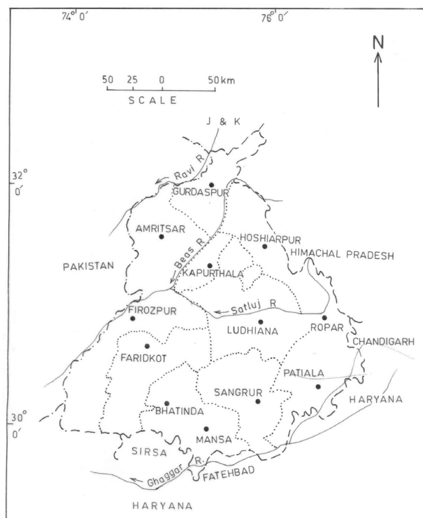
Figure 1: Location map of the study area.

The Siwalik hills form a narrow tract on the northeastern side of the state. The rest of state is a vast alluvial plain which is composed of Quaternary alluvium deposits—Older alluvium (Bhanger), Newer Alluvium (Khadar) and the Aeolian deposits. The Quaternary sequence is underlain by Tertiary deposits which in turn are underlain