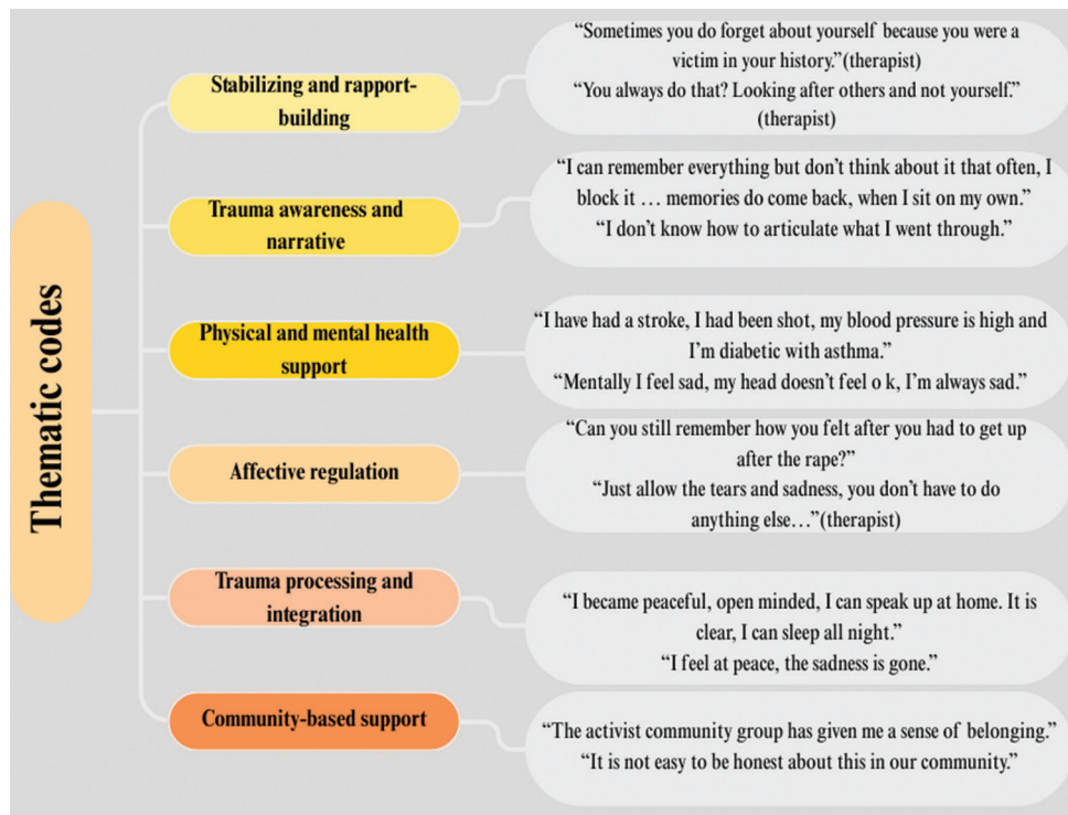
Figure 1. Thematic codes identified across phase-based integrative trauma-informed care

or indirect prompts necessitated a meticulous, stepwise approach concerning emotional regulation and trauma integration, given that their disclosure process was often circumspect or influenced by variables such as fear, mistrust, or prior adverse experiences with disclosure. These findings underscore the need for a flexible, adaptive therapeutic framework guided by ITIC phases, processes, and objectives.