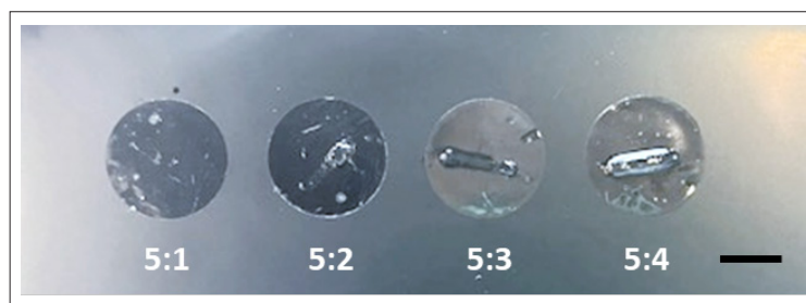
Figure S2. Pictures of the resulting photocrosslinked hydrogels using the same printing parameters (power intensity of 22 mW and stage translational speed of 0.3 mm/s) but different molar ratios of N-PLN polymer to PEG-link crosslinker. Scale bar = 5 mm.